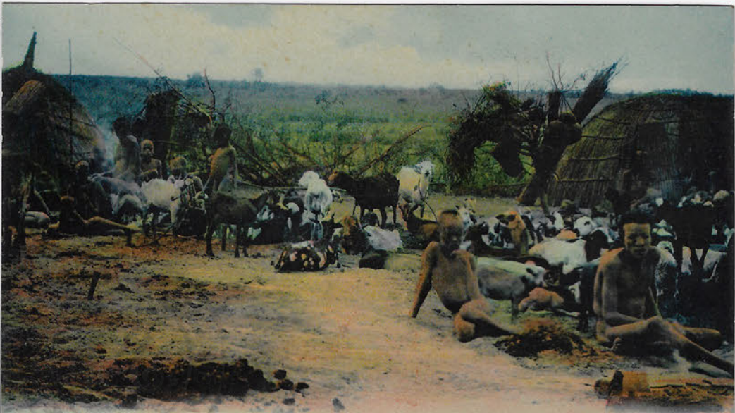
View of Chambel W. N.